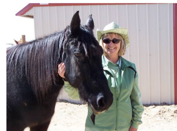
"Shane" and volunteer at Colorado Therapeutic Riding Center

Shane has a very gentle and loving spirit, he is quiet in nature. We cherish our time together; he even enjoys his grooming time as much as I do. His favorite part is having his eyes and forehead gently cleaned and as I finish grooming I give him a special hug and as my reward he lowers his head over my shoulder to give me a special hug. He is very happy being part of the CTRC herd and he knows he is cherished.